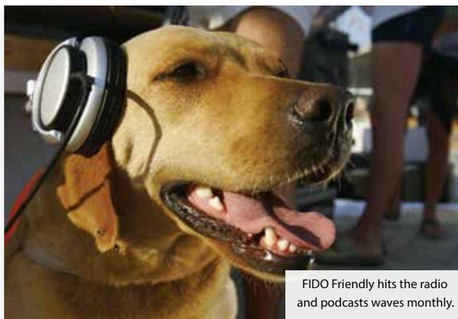
FIDO Friendly hits the radio and podcasts waves monthly.